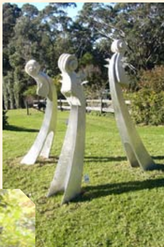
2009 People's Choice: Trio by Dora Rögnvaldsdottir